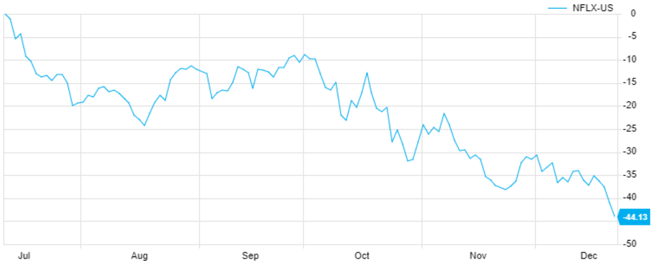
Total Return: 11 Jul '18 - 24 Dec '18