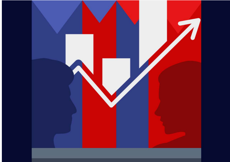
Don't Let Politics Drive Your Investment Behavior St. Louis Trust & Family Office

Just the other week, I was at a hockey game with a friend who confessed he was worried about his investments now that Trump is back in the White House. He rattled off concerns about inflation, tariffs, a higher deficit, and the potential for geopolitical unrest. It reminded me of two friends from the past who made similar mistakes.